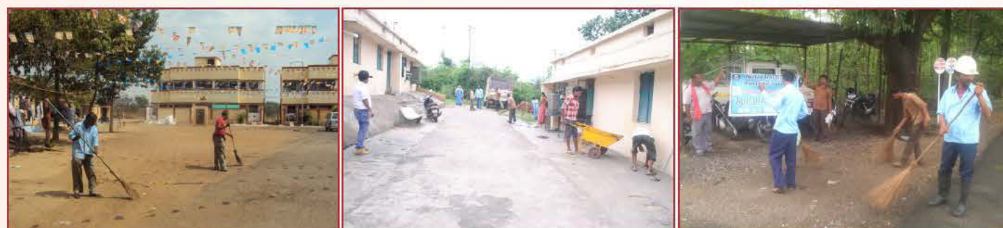
Employees Cleaning Camp Colony Ground of MOIL, Beldongri Mine