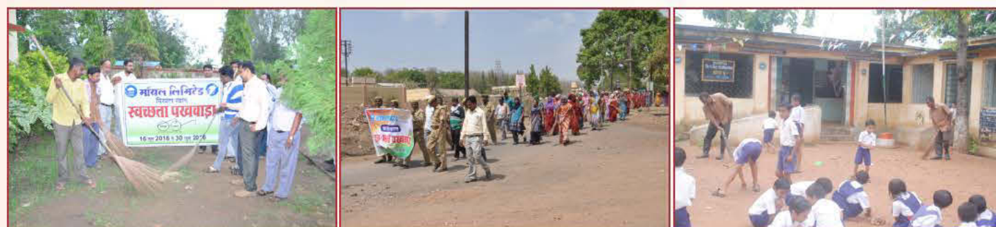
Rally of Chikla Mine Employees by Displaying Banners on Swachhta Pakhwada at MOIL, Chikla Mine

After 15 days of Swachhta Pakhwada, a concluding function was organized at Mines & Corporate Office. The employees who participated in various competitions like clean home competition, Poster making, Slogan writing, Essay writing, the winners were awarded with prizes.