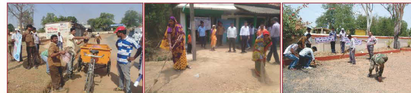
Garbage Disposed Of By Garbage Trolley by MOIL, Chikla Mine Employees

Employees visited nearby Grampanchayat villages and involved the Sarpanch, Grampanchayat members for cleaning the village roads, cleaned the Grampanchayat office premises. After cleanliness activities, a meeting was organized & issues were discussed with Sarpanch & villagers about the cleanliness.