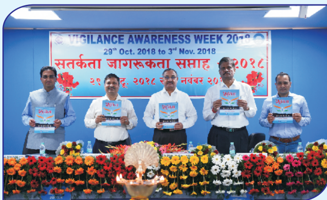
7 th Edition of Annual Vigilance Magazine "Shuchita"