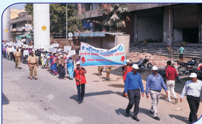
Vigilance Awareness Week –31 st October 2018