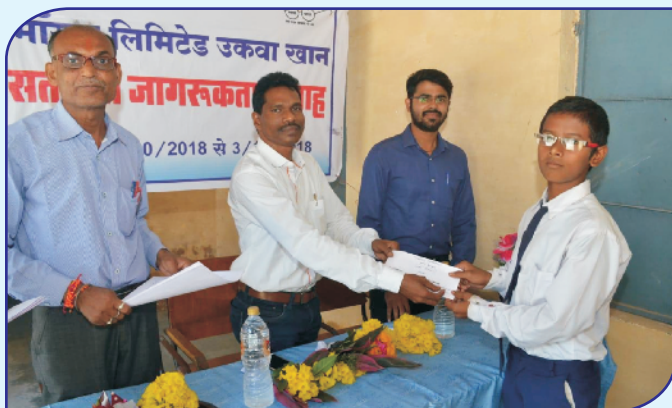
Prize Distribution of essay, poem and drawing competitions at RNT School, Balaghat and DAV MOIL Public School, Chikla.