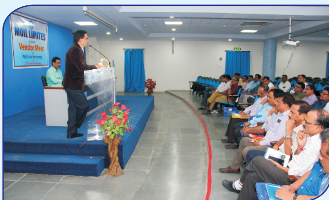
Vigilance Awareness Week -Vendor Meet At H.O.